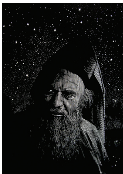
Ieronim, the mourning monk. Barry Moser.