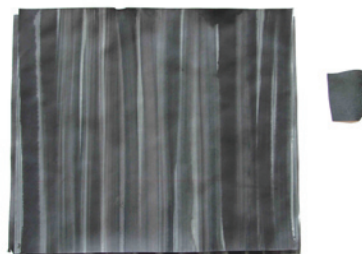
Decorative endpapers & leather sample for the deluxe edition. Sarah Creighton.